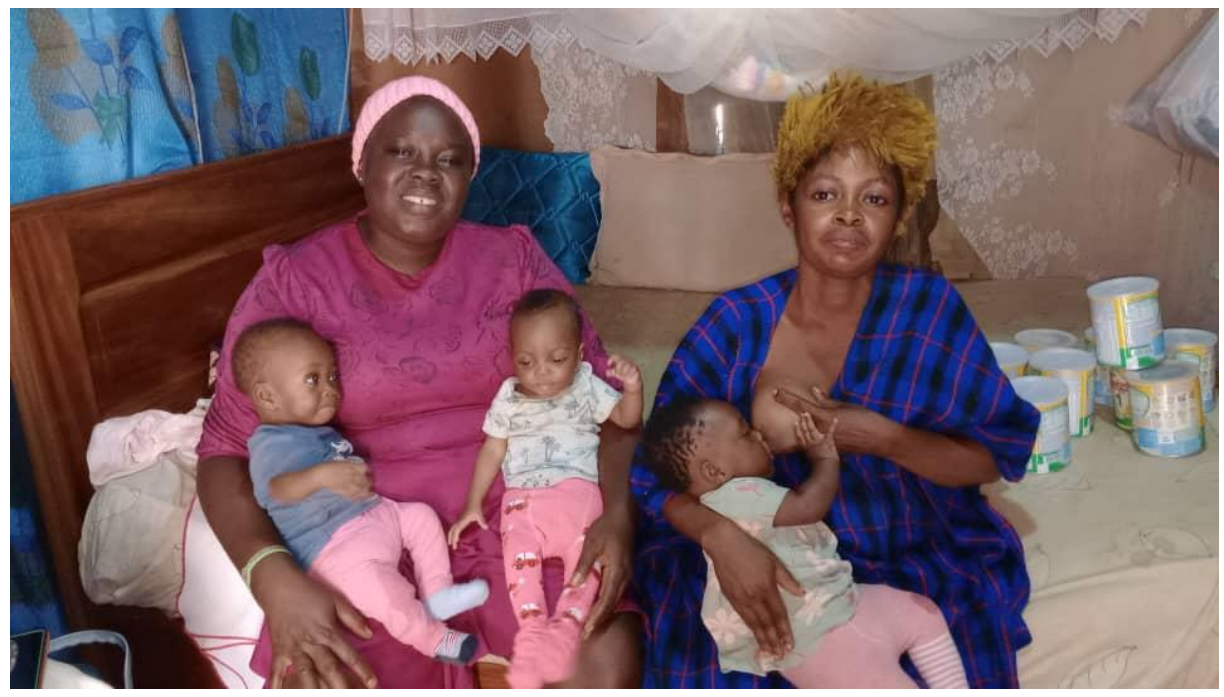
270 000 cfa = € 412.21

The help ended on May 23, 2023 after six months of providing the girls with powdered milk.