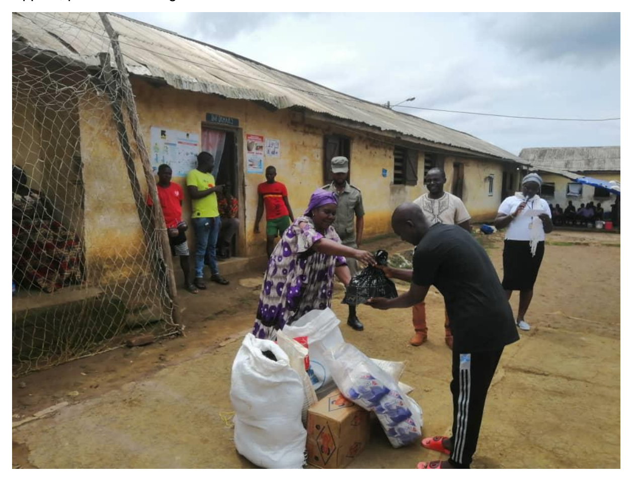
163 000 cfa = € 248,85

The Day of the African Child was celebrated with the theme 'rights of the child in this digital world'. After participating in this theme at the Kumba Prison, the young prisoners gave presentations. At the end, they all got a bag containing a bowl, rice, garri, soap, maggi, slippers, peanuts and sugar.