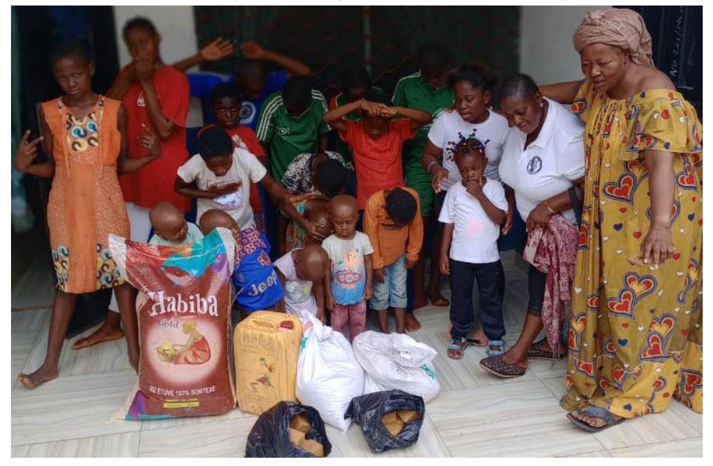
418 700 cfa = € 639,24

Like every year, this year we have not forgotten the children from the various orphanages in Kumba. It has now become a tradition to give food to all orphanages at Christmas. This year we also distributed rice, oil, peanuts, soy beans and medical soap.