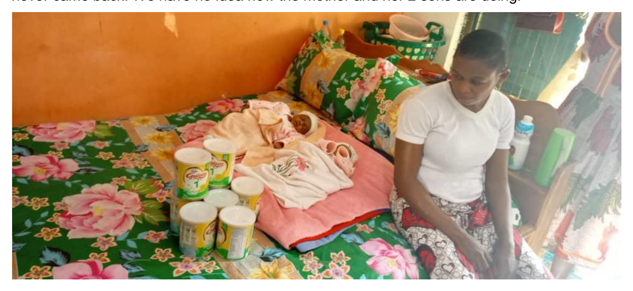
201 000 cfa = € 306,87

It was April 22, 2023 when the team received a call from the head nurse of the children's department. An HIV positive girl had given birth to twins. Two boys. However, she could not breastfeed her sons due to HIV, but there was no money for powdered milk. The foundation was asked to help. We started by giving powdered milk. We do this monthly. However, it remained at 2 months instead of 6 months. This is because the mother left for her village and never came back. We have no idea how the mother and her 2 sons are doing.